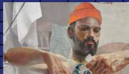
CASE MACLAIM (GER) @CASE_MACLAIM