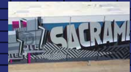
TRAV MSK (USA) @TRAVMSK