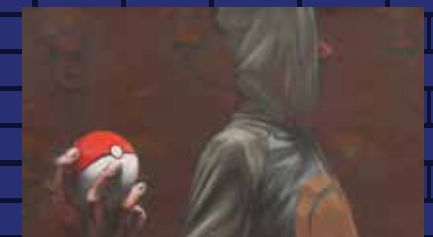
SIGUEL (POL) @ELSIGUEL