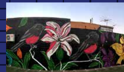
PONCHO ARMY (AUS) @PONCHOARMY