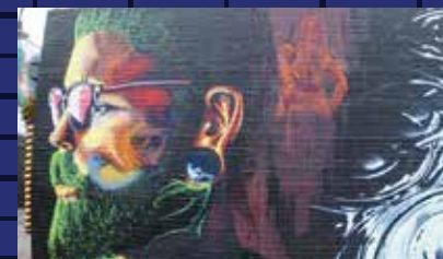
LORETTA LIZZIO (AUS) @LORETTALIZZIO